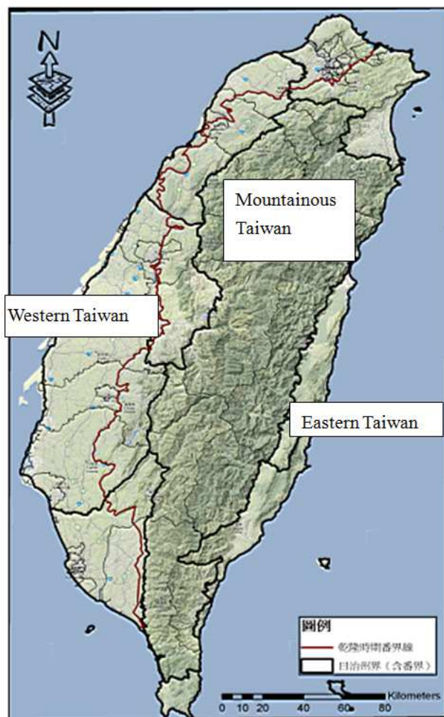
Fig 1. Taiwan aboriginal border line